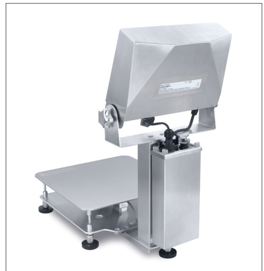
Optional External Power Bank Holder for i-D61XWE Models